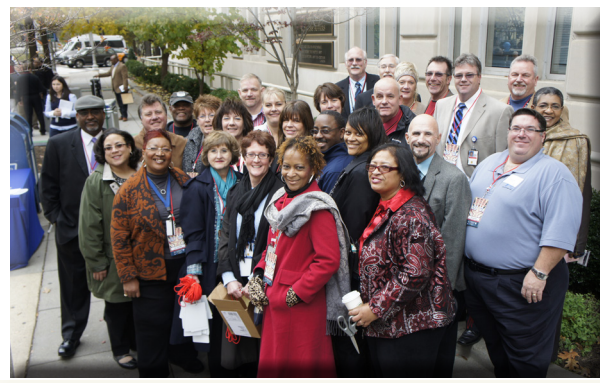
VAVS Staff from VA Central Office and hospitals around the country came together for a special Veteran's Day Celebration and concert in Washington, DC.

Enhance VSS to Keep Up with Increasing Demands for Data