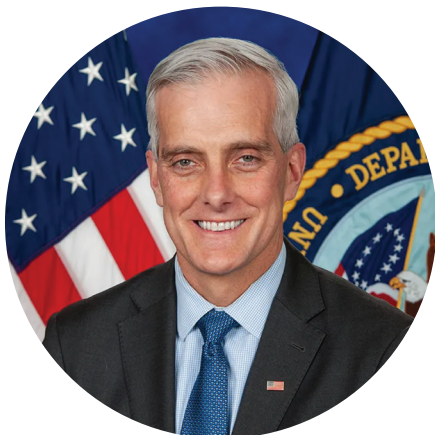
Denis R. McDonough Secretary of Veterans Affairs

The Honorable Denis Richard McDonough was nominated by President Biden to lead the Department of Veterans Affairs. Mr. McDonough's nomination was confirmed by the United States Senate on February 8th, 2021, and he was sworn in the following day as the 11th Secretary of Veterans Affairs.